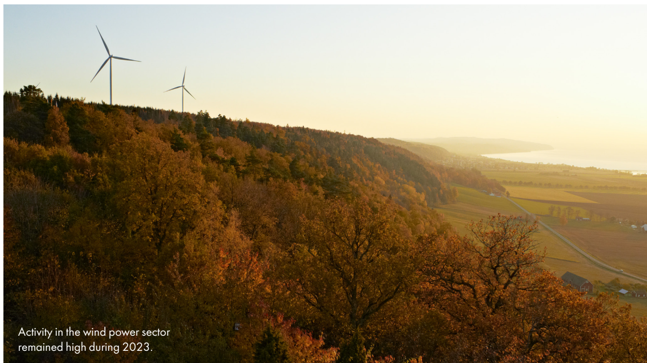
Activity in the wind power sector remained high during 2023.

A governmental inquiry (SOU) was presented in October 2023 that proposes drastic changes in the legislation of electricity network companies. Due to the EU regulatory framework the Swedish Energy Markets Inspectorate shall have a greater independence than earlier. The investigation has been sent for referral and the changes are proposed to come into effect in 2025 and thus be taken into consideration for the regulatory period 2028–2031.