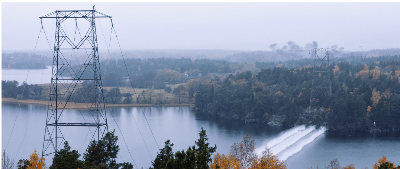
Demolition of the old overhead line between Beckomberga and Bredäng began at the end of 2023 through explosive demolition.

The new Beckomberga–Bredäng power cable was brought into operation in October and the demolition of the old overhead lines has begun. The new cable is unique in that it is the first time a 400 kV line is established through such a densely populated area. Half of the 12 kilometres long power line lies at the bottom of Lake Mälaren, and the other half is buried in the ground.